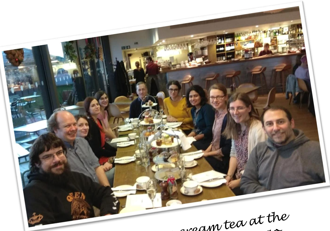
Enjoying a cream tea at the Ashmolean a few years ago